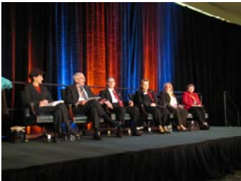
The Thursday plenary session featured a panel of Commission leaders.