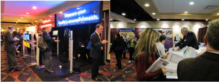
The exhibit hall was a popular destination during the conference.